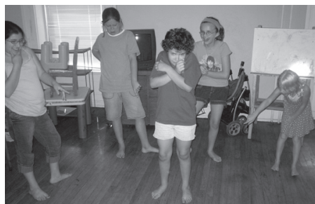
Exploring "What it's like to be a girl."

This summer LFL held its first Summer Drama Day Camp!! During the week of June 11-15, LFL hosted one session for 3-5 year olds and one session for 6-11 year olds at Casa Latina. The camp was such a huge success that we offered a second camp the week of August 11-15 for 3-5 year olds. We are looking forward to offering more Summer Drama Day Camp options next summer.