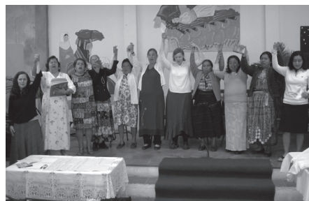
Unidas - closing song of the performance.

LFL is committed to working with the Sinódica to accomplish these goals. However, we will need considerable financial support to achieve them.