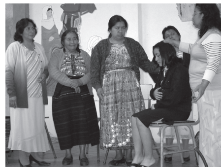
Encouraging a young woman in distress.